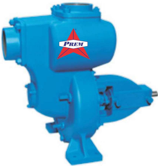
PUMP - 4" X 4"