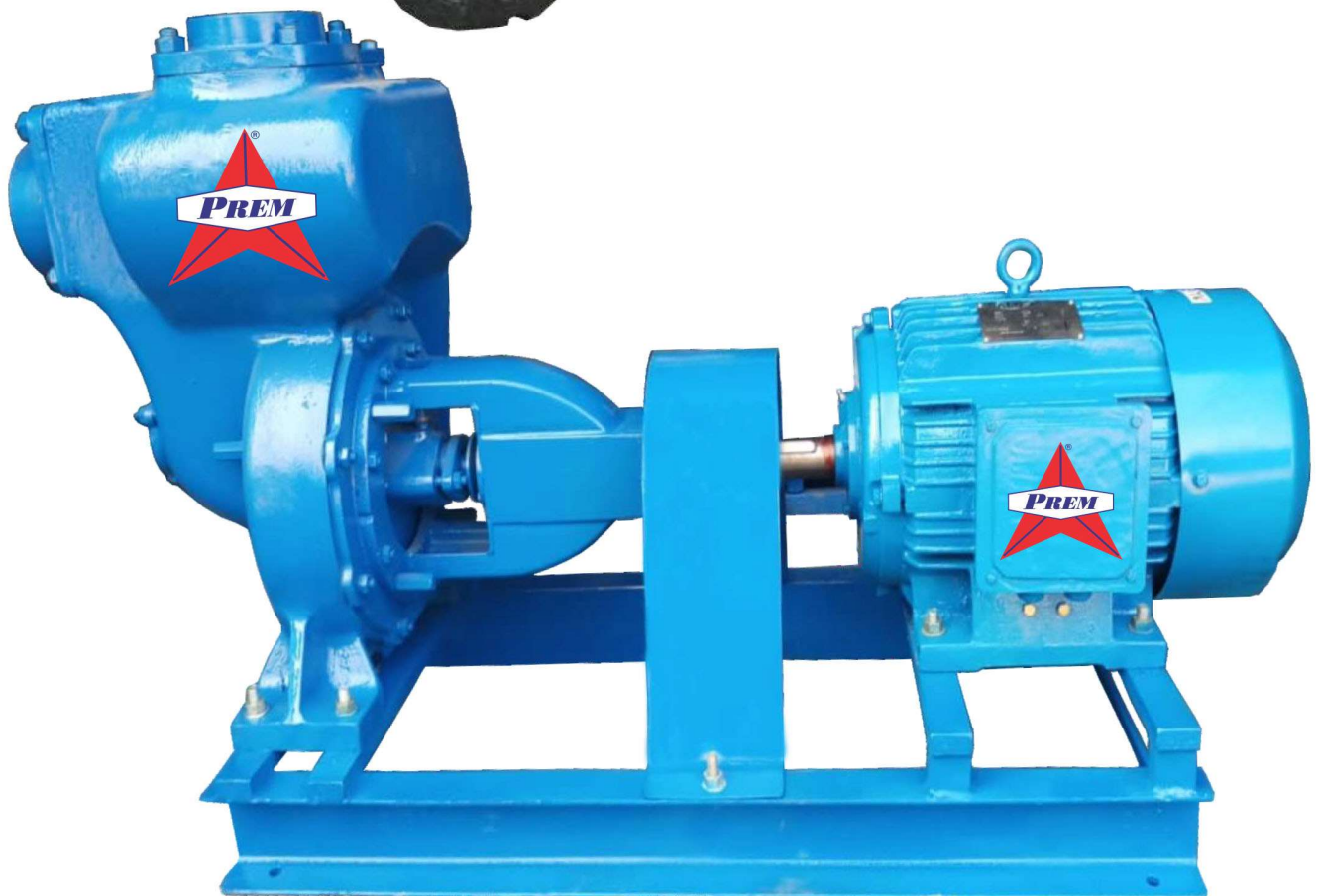
Self Priming Pump with Electric Motor