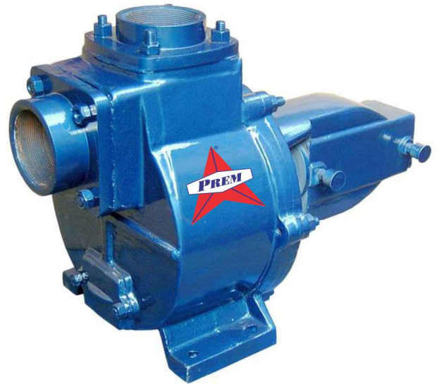
NSP - 4" X 4"