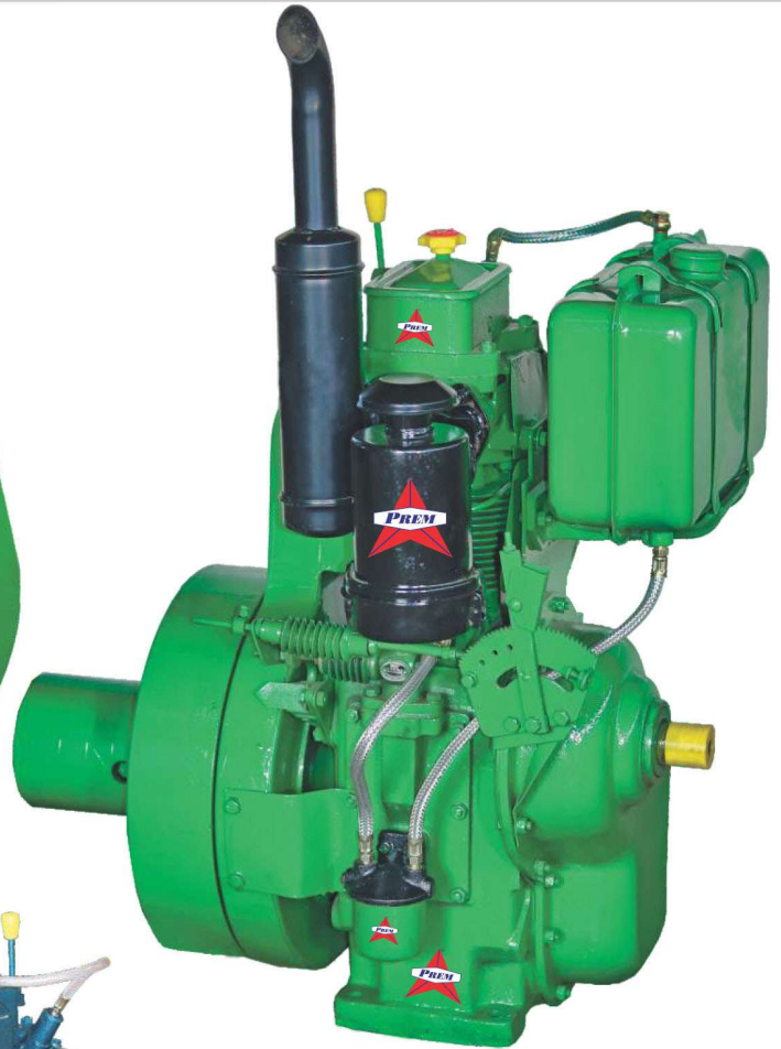
With Variable Speed lever