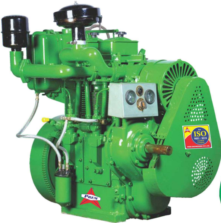
Blower Type Electric Start

Application Use : Pumpsets, Diesel Generating Sets, Industrial & Construction Equipments